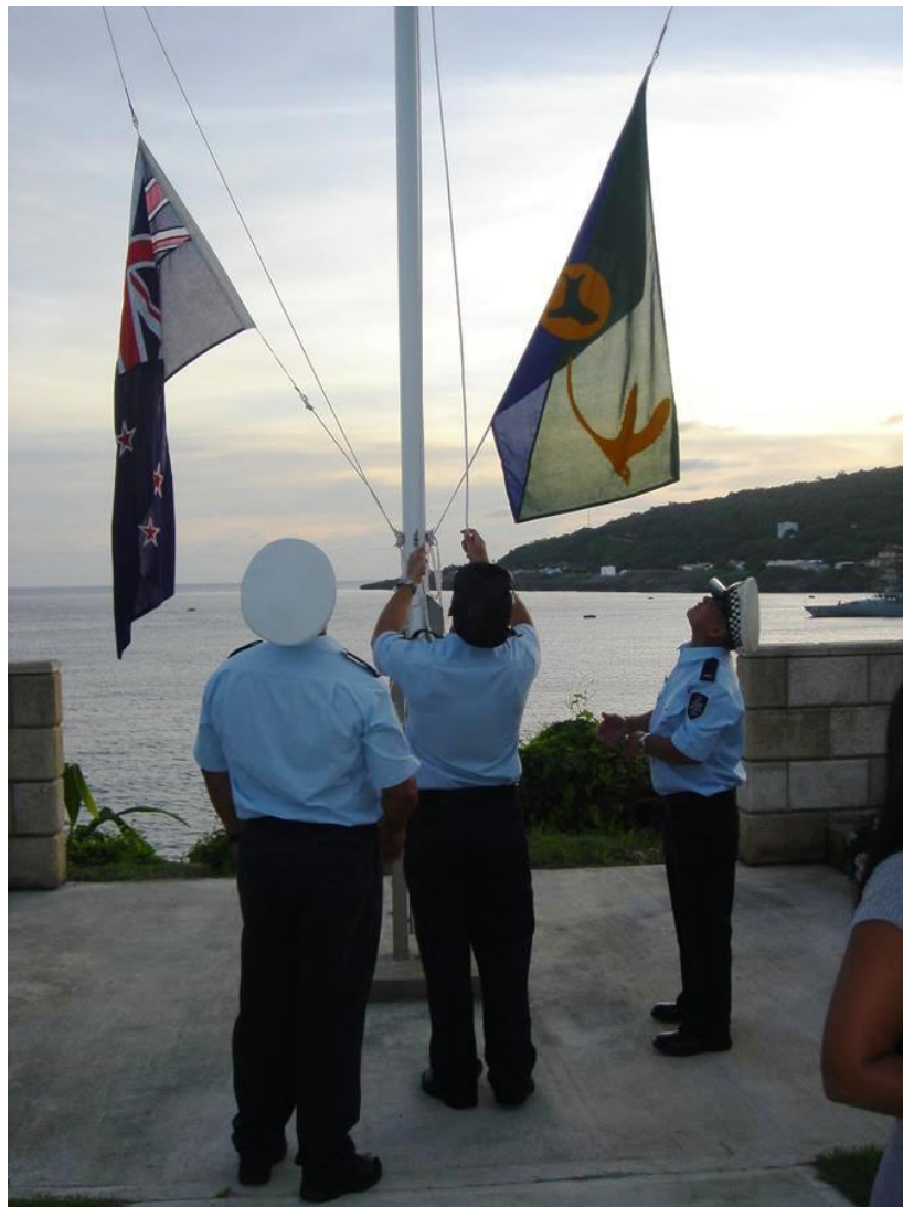
Raising of the flags by members of the Police personnel on ANZAC Day. 25 April 2011.